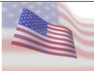
Spring Musical "America's Kids"

We're sorry but no late orders will be accepted.